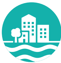
Cities & Regions

More specifically, we offer expertise in the following :